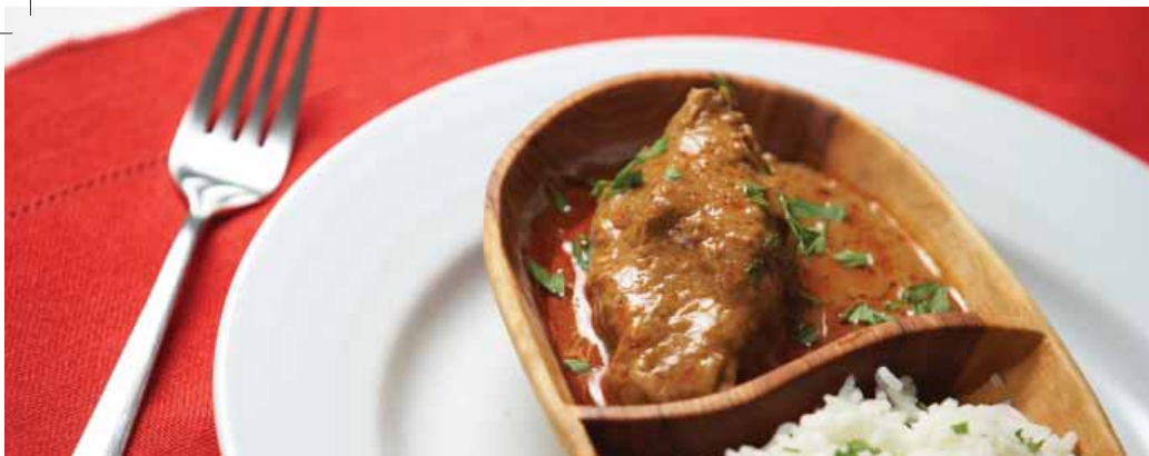
~ GROUNDNUT SOUP ~