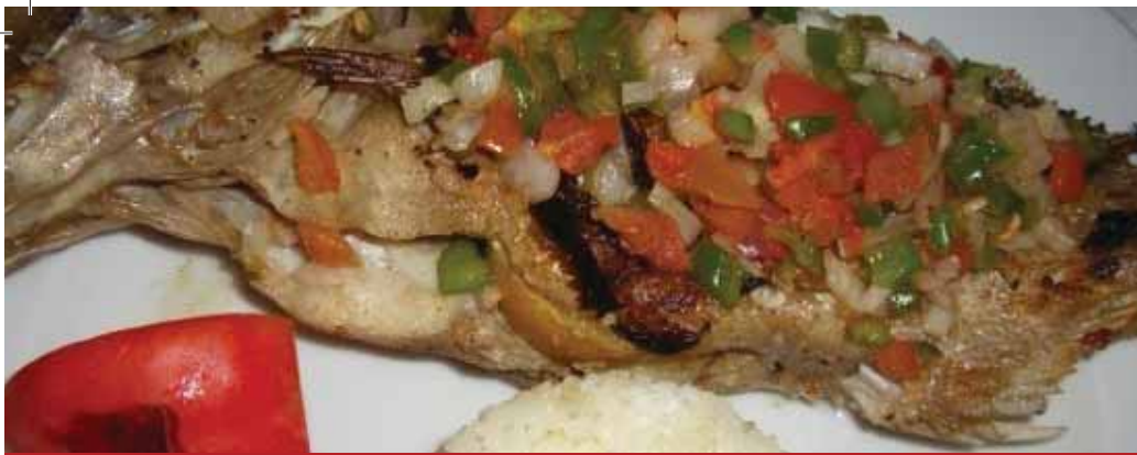
~ BAKED FISH WITH HIBISCUS LEAVES SAUCE ~