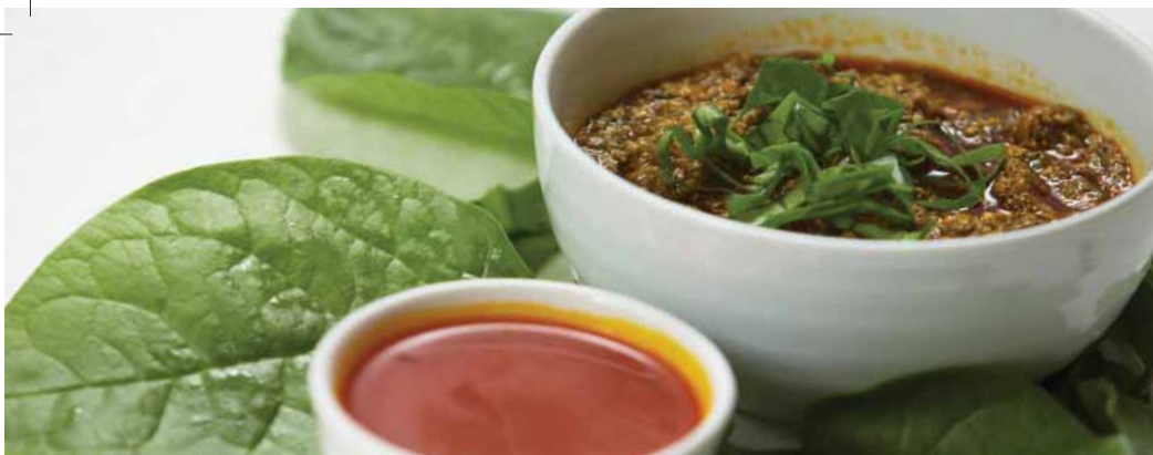
~ PALAVA SAUCE ~