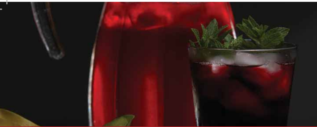
~ BISSAP JUICE ~