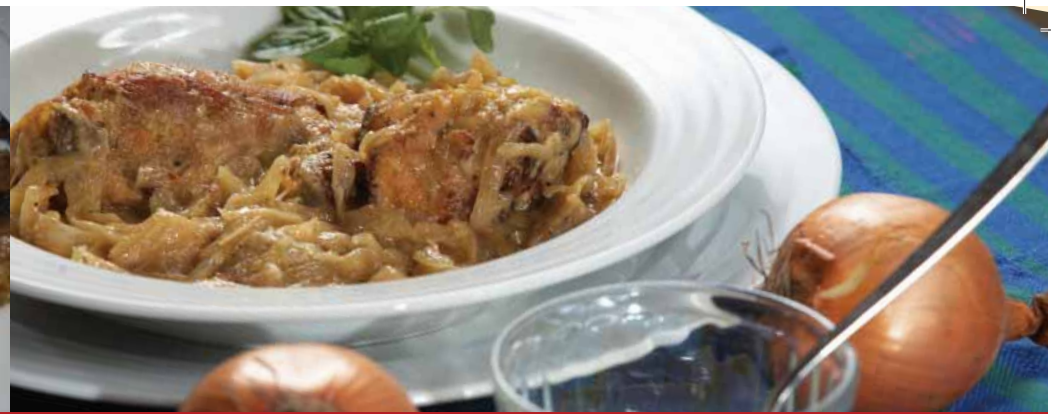
~ CHICKEN YASSA ~