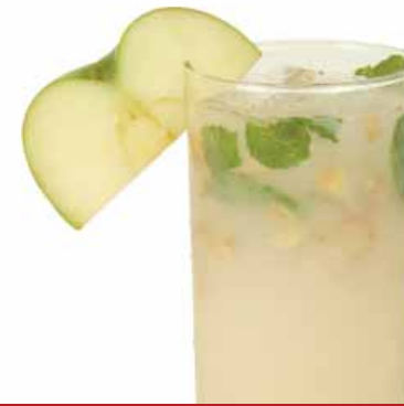
~ GINGEMBRE JUICE ~