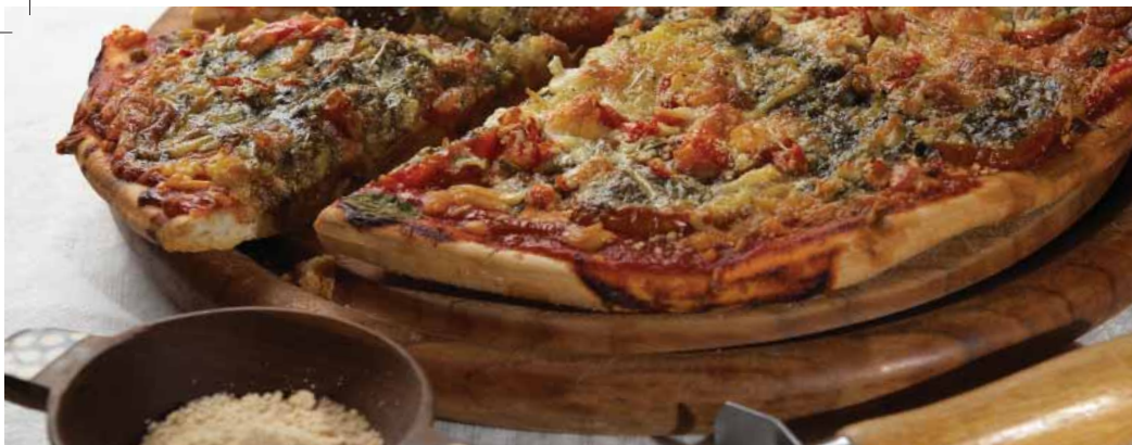
~ MILLET PIZZA ~