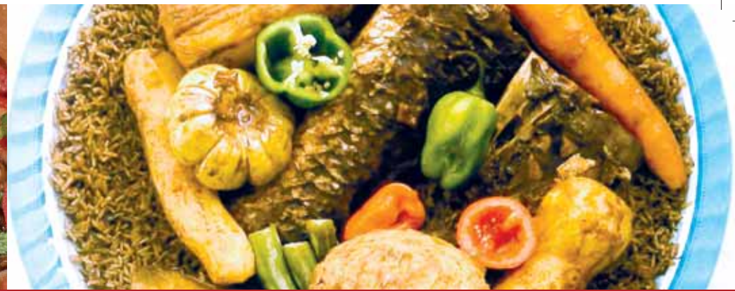
~ TIEBOU DIEUNE ~