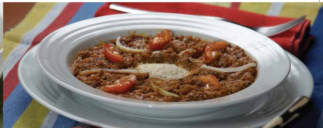
~ RED RED WITH GARI ~