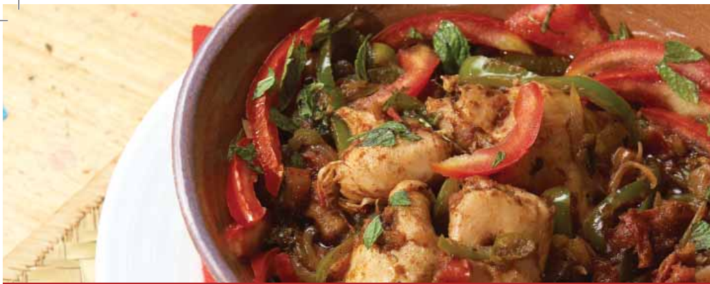
~ SHITTO-STYLE CHICKEN ~