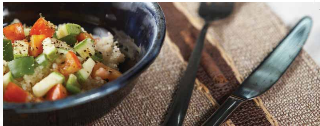
~ ATTIEKE SALAD WITH FISH ~