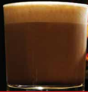
~ KOLA COFFEE MOCHA ~