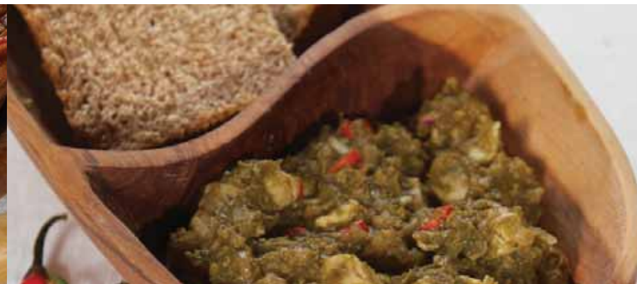
~ MOUKO SHIW ~